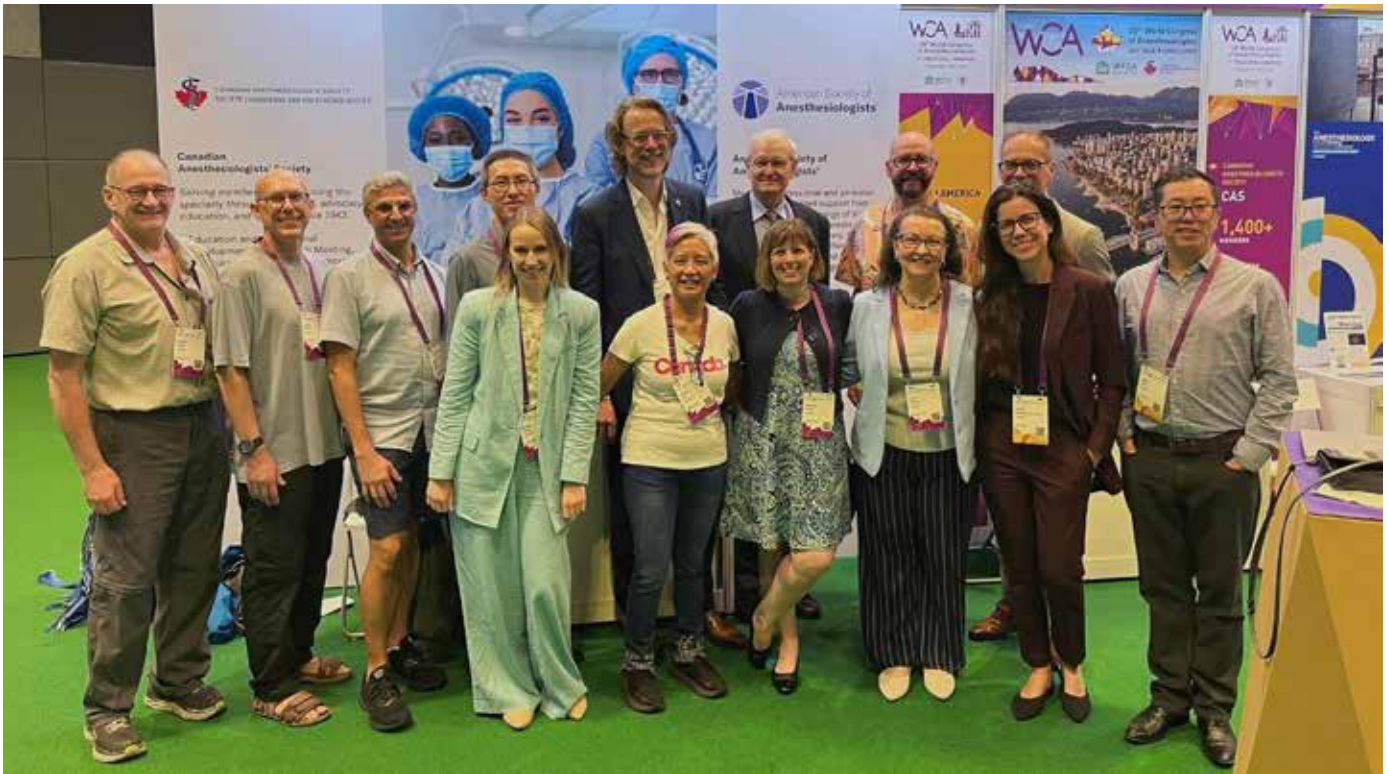
CAS delegates and office staff at #WCA2024 in Singapore