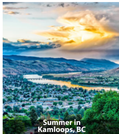
Summer in Kamloops, BC